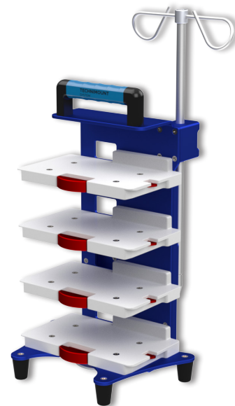
Bracket Pro Serie 80-FL4 for Stacks of 4 B-Braun Pumps