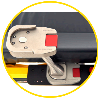
Safety MD Transporter (Horizontal)