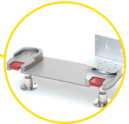
Proplate with 2 Micro Bases for IT Stretchers