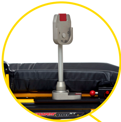
Safety MD Transporter